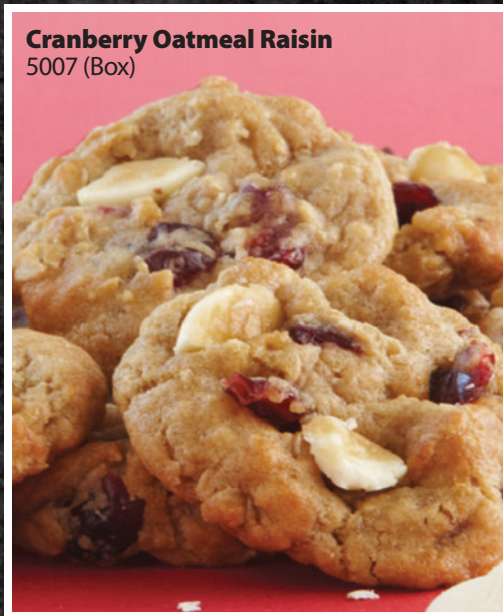
Cranberry Oatmeal Raisin 5007 (Box)