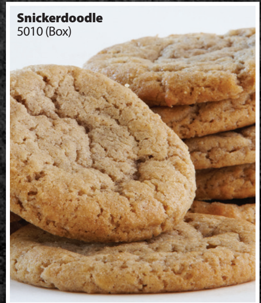
Snickerdoodle 5010 (Box)