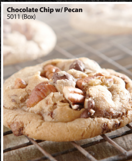
Chocolate Chip w/ Pecan 5011 (Box)