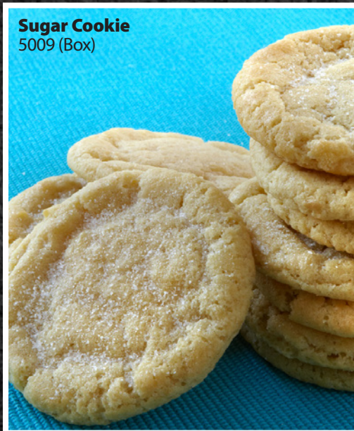
Sugar Cookie 5009 (Box)