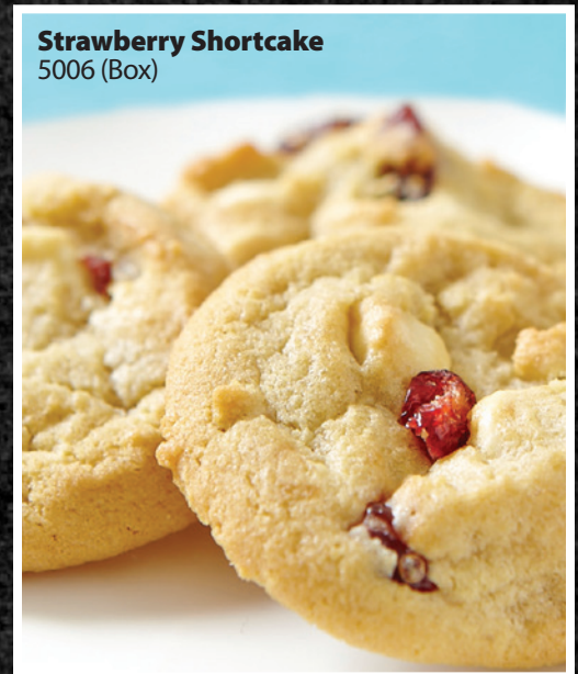
Strawberry Shortcake 5006 (Box)