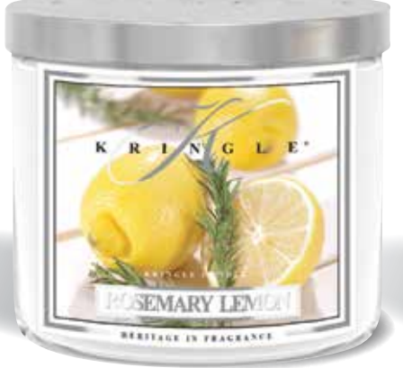
916 • ROSEMARY LEMON Lavish lemon finds its fragrant soul-mate when matched with savory rosemary.