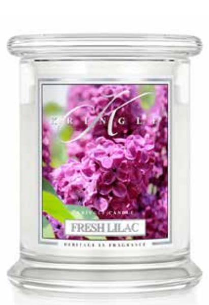
904 • FRESH LILAC A soft, magical floral recalling the very essence of springtime, our delicate Fresh Lilac is simple, pure and honest.