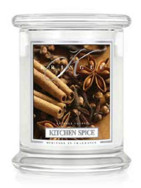
905 • KITCHEN SPICE A blissful blend of spice and everything nice.