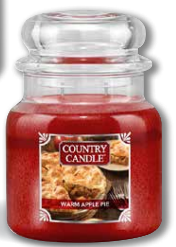
912 • WARM APPLE PIE Mouth-watering aroma with sweet apples, butter and spices straight rom the oven...á La Mode!