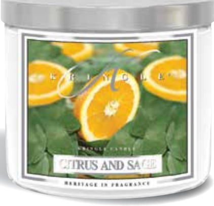
917 • CITRUS & SAGE Tangy, bright citrus accords partner with green herbal notes to produce a relaxing yet uplifting union.