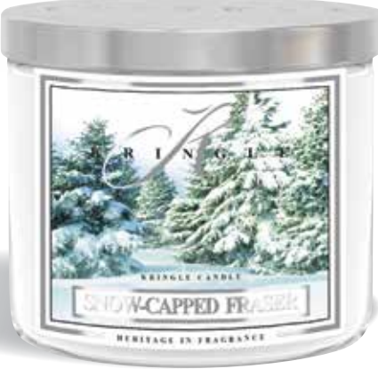
913 • SNOW CAPPED FRAZIER Authentic botanical fir tree base. Hints of warm amber and moss further enrich the senses.