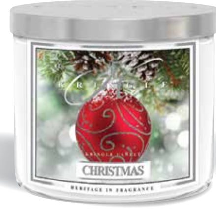
915 • CHRISTMAS This is the fragrance of the holiday that is awaited eagerly all year.

914 • BALSAM FIR Botanically-accurate woodland fragrance evoking cold winter air and fresh-cut boughs.